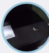
Magnetism Head Detection With LED Light Indication