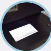
Detect watermark With White Light