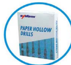
Good quality bits