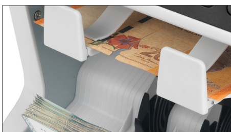
Identifies banknotes that are unfit for ATM machines and recirculation