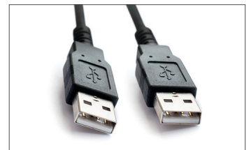
Safescan USB Cable Art. no: 124-0458