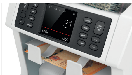
Suspected counterfeit banknotes are placed in the reject pocket