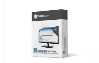
Safescan MCS Software Art. no: 124-0500