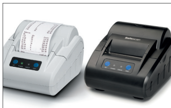
Safescan TP-230 Thermal printer Art. no: 134-0475 grey Art. no: 134-0535 black