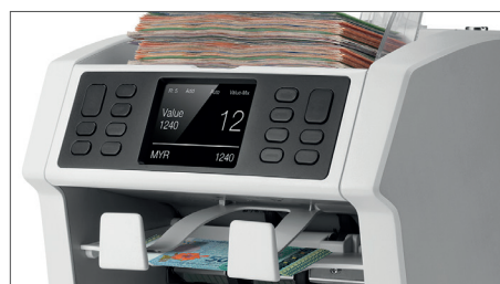
Value-mix: Counts banknotes in stacks of a preset value