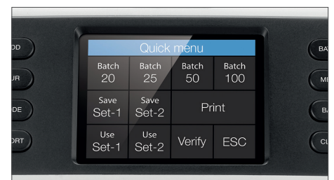
Large touch screen with quick menu and numeric keyboard