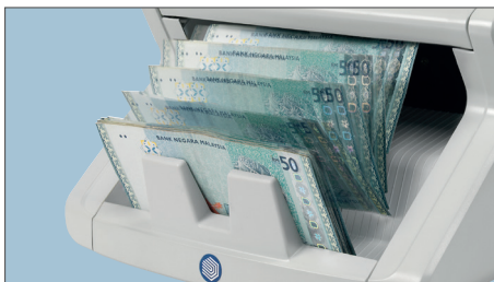
HIGH-SPEED COUNTING OF SORTED BANKNOTES