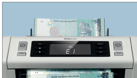
UV COUNTERFEIT DETECTION