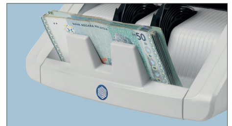
ADJUSTABLE BATCH FUNCTION FOR CREATING EQUAL STACKS OF BANKNOTES