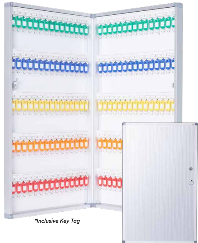
*Inclusive Key Tag