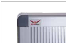
Sturdy Aluminium Body & Frame

Our Key Cabinet body construction is built with anodised aluminium for extra durability. It comes with colour coded key tags for easy organisation and wall fixings for wall mounted purposes. Suitable for warehouses, hotels, hospitals, schools, shops, and personal residences.