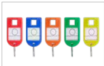
Key Tag WB86 *5 Colours

Store, retrieve and view available keys with our Key Panels. With a key-lock to secure access and rollers for smooth glass panel sliding. It can also be used to hook and display other small-sized items.