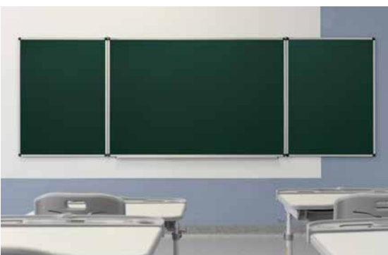
After applying green film on board