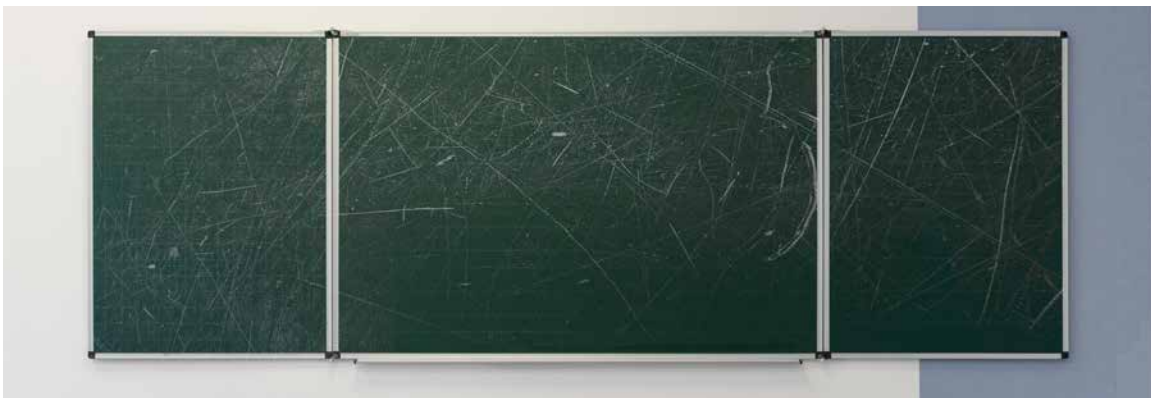
Before applying green or white film on board