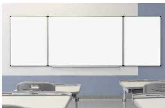
After applying white film on board