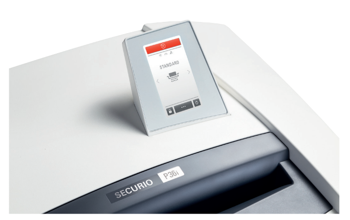
Intuitive operation and multi-language menu selection via the high resolution 4.3" touch display.