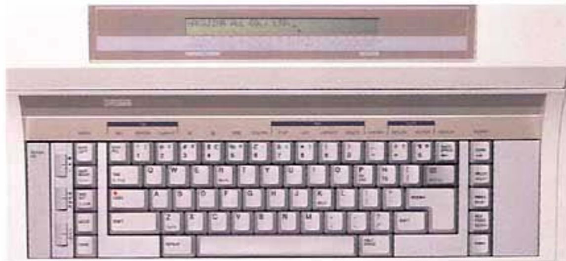
● USER-FRIENDLY KEYBOARD

SPECIFICATIONS ARE SUBJECT TO CHANGE WITHOUT NOTICE.