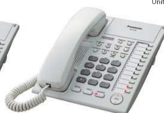
■ KX-T7750 Monitor Unit