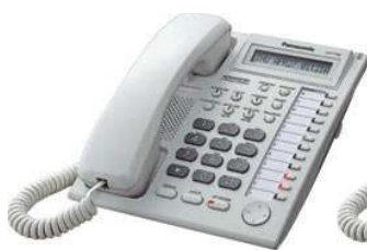
■ KX-T7730 Speakerphone Unit