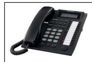
Units available in Black and White

* An optional card is required. Please contact your dealer or phone company to confirm if the Caller ID service is available in your area.