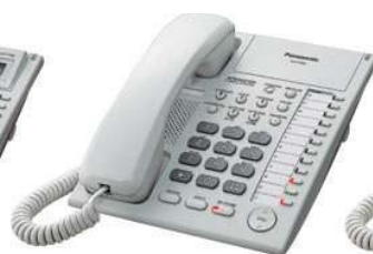
■ KX-T7720 Speakerphone Unit