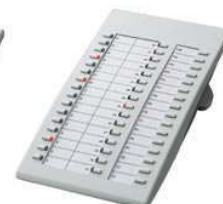
■ KX-T7740 DSS Console