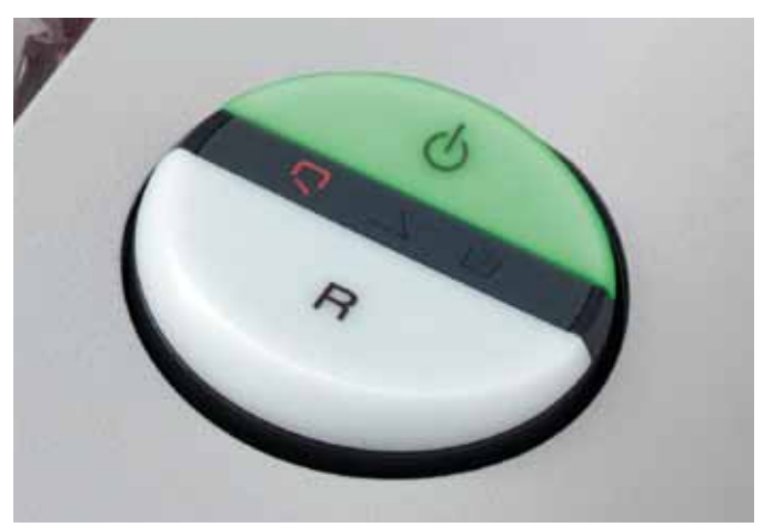
EASY_SWITCH Ease of operation: intelligent multifunction switch element with integrated optical signals indicating the operational status. Additional "emergency switch" function.