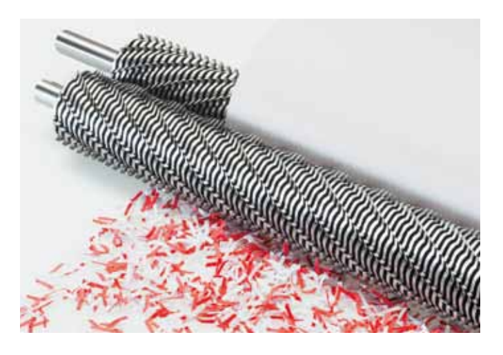
SOLID STEEL CUTTING SHAFTS Robust and durable: high-quality paper clip proof cutting shafts from special hardened steel. 30 years guarantee on the cutting shafts.