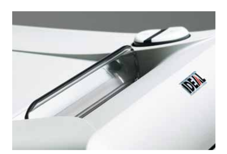
SAFETY FLAP Extremely safe: electronically controlled safety flap in the feed opening to keep fingers, ties or other objects away from the cutting shafts.