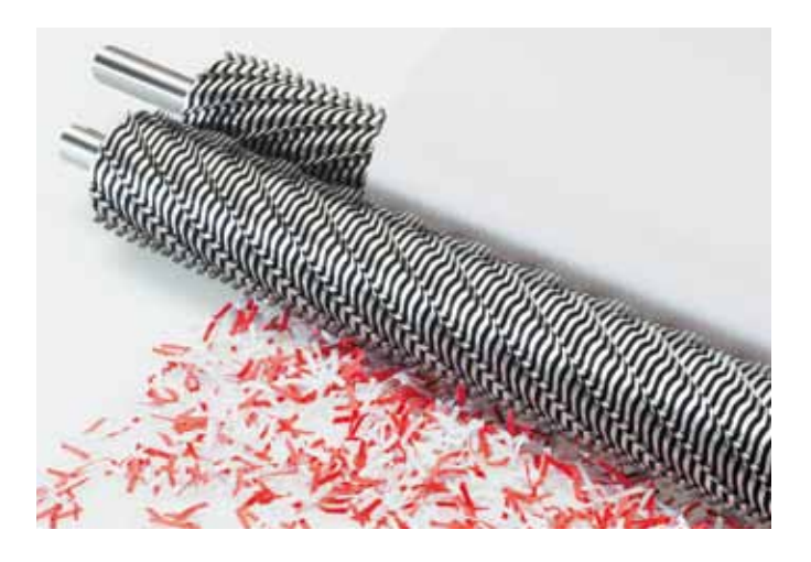
SOLID STEEL CUTTING SHAFTS Robust and durable: high-quality paper clip proof cutting shafts from special hardened steel. 30 years guarantee on the cutting shafts.