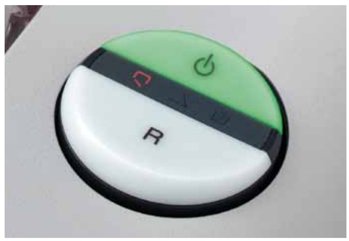
EASY_SWITCH Ease of operation: intelligent multifunction switch element with integrated optical signals indicating the operational status. Additional "emergency switch" function.